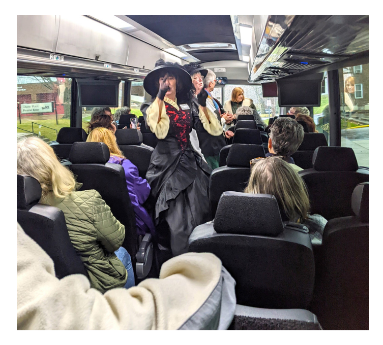
When a bus group is ready to leave the Museum, we board the bus to thank them for coming. During the holidays, we ask them to join us in singing a short Christmas song. They all join in with smiles and laughter.