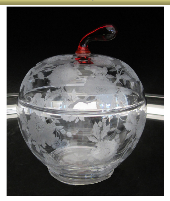
Pristine 316 Candy Box, Carmen Stem, Blossom Time