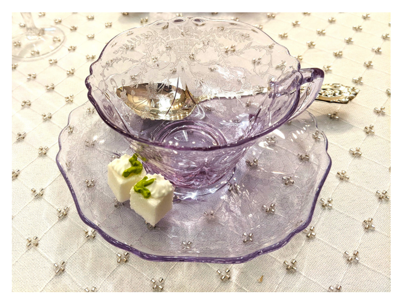
This Heatherbloom cup and saucer set, etched Portia, is included in the new display. The flatware used in the display is the Wallace Sterling, Rose Point pattern.