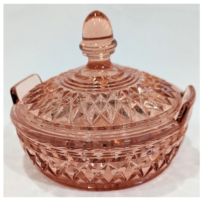
Stratford #73 5" Butter Tub, 2-handle and Cover, Peach-Blo