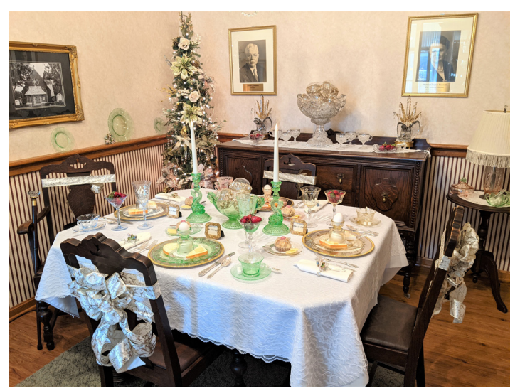
There have been many positive comments about the new Dining Room. Most people say how they would love to be entertained in the room.

Wishing you a Safe, Healthy & Happy New Year!