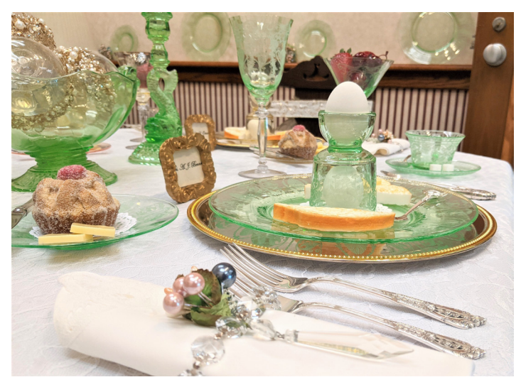
The new Museum Dining Room display features the No. 748 – 5 oz. Double Egg Cups in Light Emerald, Gold Krystol and Willow Blue.

The new Museum Dining Room, "A Christmas Brunch with Cambridge" was in place for the holiday season with great reviews. The inspiration for the display came from the donation of a Light Emerald double egg cup etched Apple Blossom from Ann Stoetzer. The four place settings are; Willow Blue, Gold Krystol, Peach Blo and Light Emerald. We do not have the double egg cup in Peach Blo, so if you ever happen to see one, please let me know.