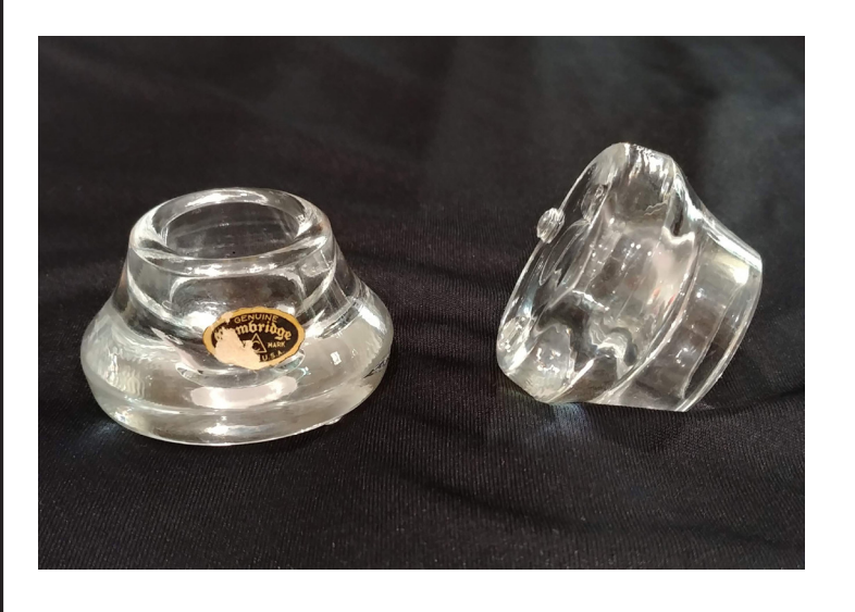
#1050 Candle Holder for #1041 41/2 Swan