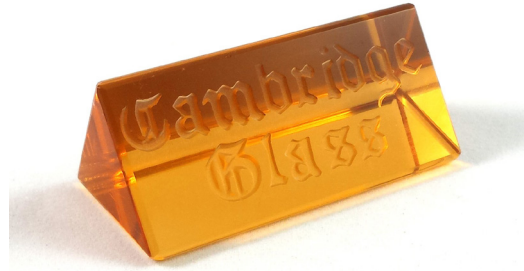
1015 - Dealer Prism Sign, Madeira