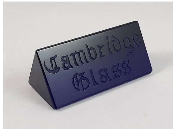
1015 - Dealer Prism Sign, Royal Blue