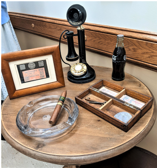
Part of the new Restaurant exhibit displays original Cambridge Cafeteria tokens and tickets.