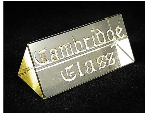
1015 - Dealer Prism Sign, Gold Krystol, Gold Encrusted