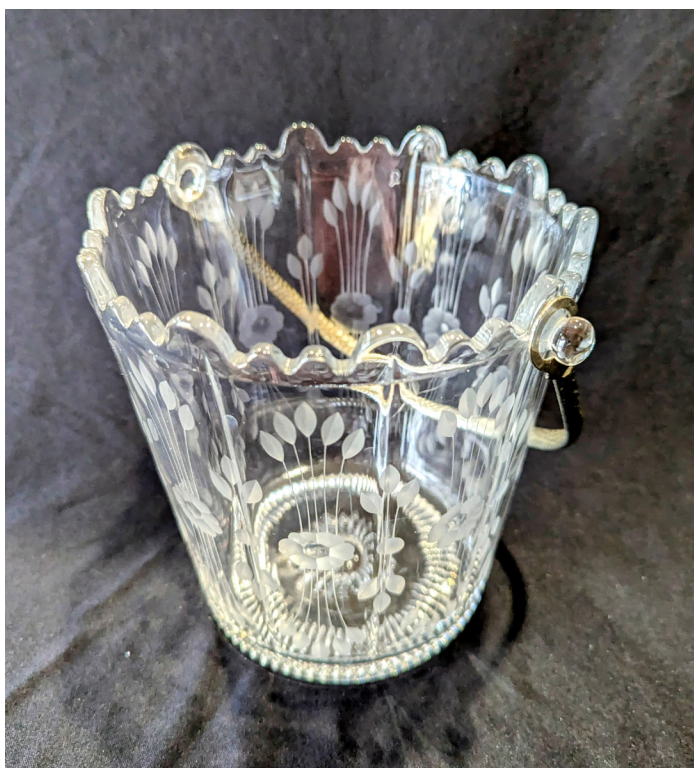
3600/674 Martha Ice Pail, Engraved #995 Lyric