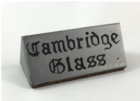
Dealer Prism Sign, Metal Reproduction