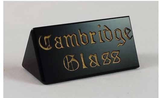
1015 - Dealer Prism Sign, Ebony, Gold Encrusted