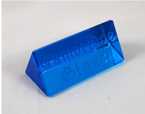
1015 - Dealer Prism Sign, Bluebell