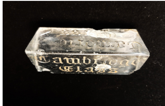
Dealer Prism Sign - double struck