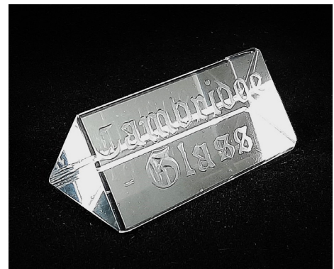
1015 - Dealer Prism Sign, crystal