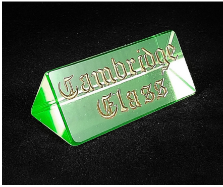
1015 - Dealer Prism Sign, Light Emerald, Gold Encrusted