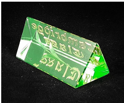
1015 - Dealer Prism Sign, Light Emerald, Gold Encrusted, Gray Cutting