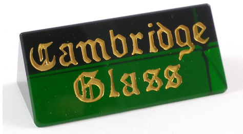
1015 - Dealer Prism Sign, Forest Green, Gold Encrusted