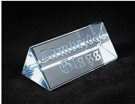
1015 - Dealer Prism Sign, Willow Blue