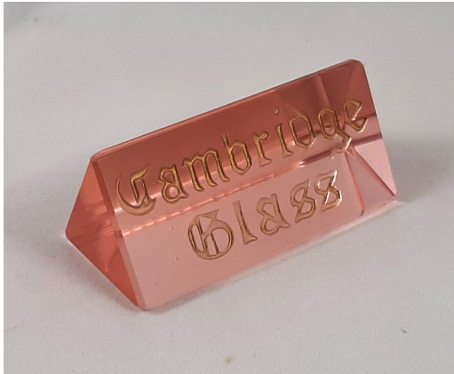
1015 - Dealer Prism Sign, Peach-Blond