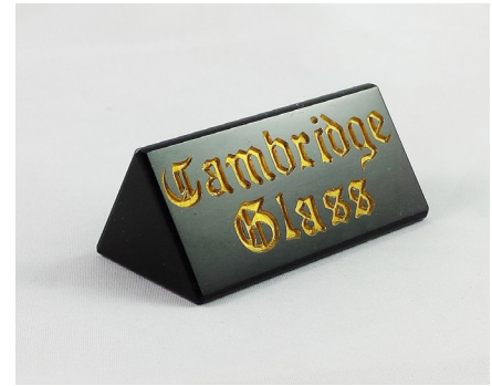
1015 - Dealer Prism Sign, Amethyst, Gold Encrusted