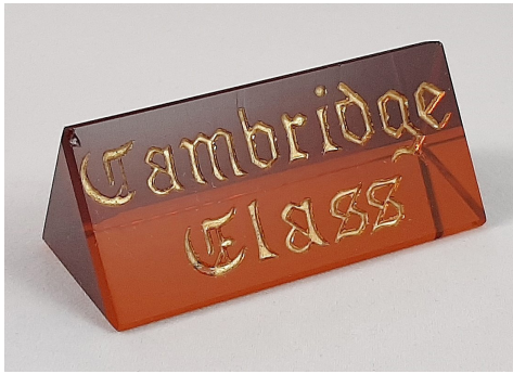
1015 - Dealer Prism Sign, Amber, Gold Encrusted