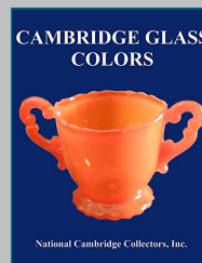
Cambridge Glass Colors

The following books can be purchased on Amazon and downloaded to your Kindle device