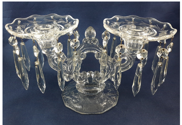
1268 - 6 ½ in. 2-Lite Candelabrum, RCE 560