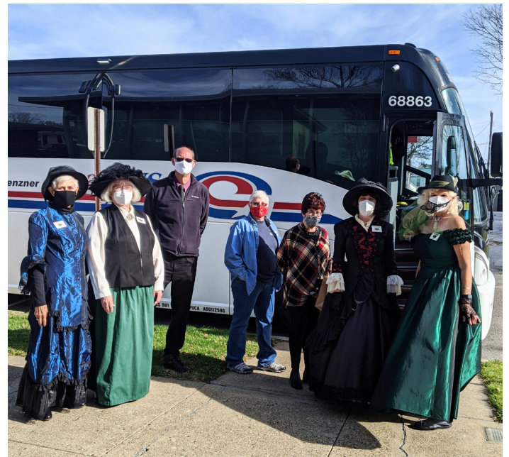
The number of passengers on each of our motorcoach groups this year was about half of what usually arrives. They were all very polite and enjoyed the National Museum of Cambridge Glass.