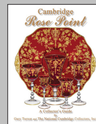
Cambridge Rose Point