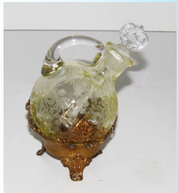
3400/97 Apple Blossom Gold Krystal in ormolu holder