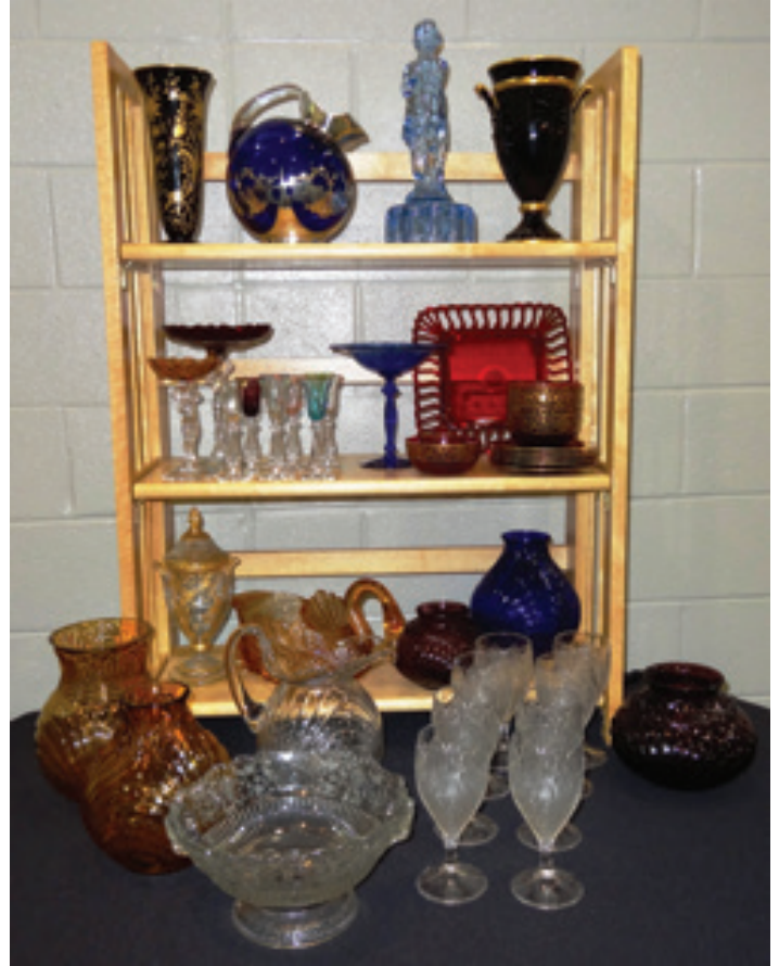
Glass included in the 2013 Museum Forever Raffle.

This is only one example of a gift to the NCC. Other possibilities include monetary donations, stocks and bonds, or other items of value. If you have questions or would like to discuss being a member in the Heritage Society, please contact any member of your Board of Directors.