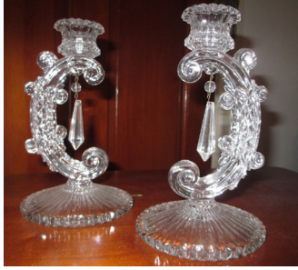
449 Virginian candlesticks