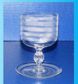
1066 cigarette holder, etched Yukon