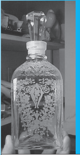
1380/1 26 oz Square Decanter etched Diane