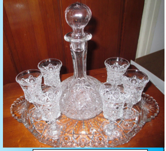
Near Cut Feather decanter set