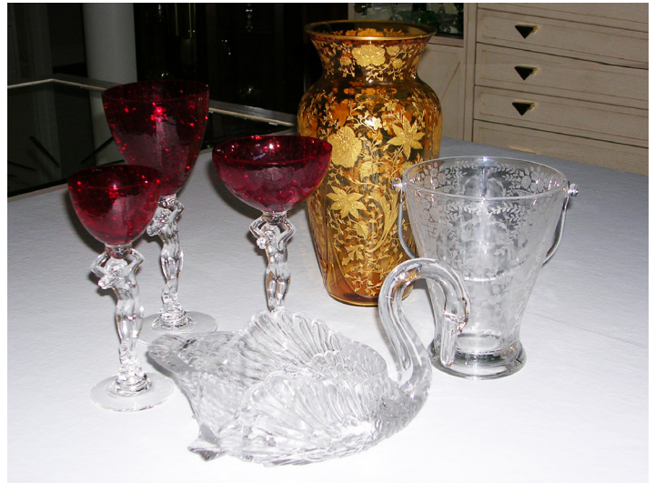
Purchases made at the Clearwater Glass Show. (Carmen crackle #3011 nude table goblet, Carmen crackle #3011 nude champagne, Carmen crackle #3011 nude tall cocktail, #1043 8.5" type 2 crystal swan, Pristine #672 ice bucket etched Portia, #1242 Amber vase gold encrusted Wildflower).