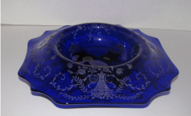
Royal Blue 3400/2 12" bowl etched Portia