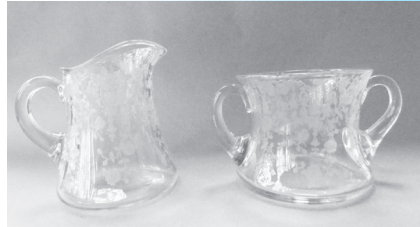
Rose Point #137 cream and sugar