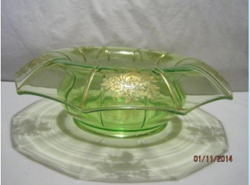
751 - 12½" flower bowl with GE Dresden Rose