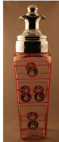
1020 - 34 oz. Cocktail Shaker with the 2-lip Chrome Top, beautifully enameled in the very desirable D/986 Wise, Otherwise, Theorize, Harmonize decoration