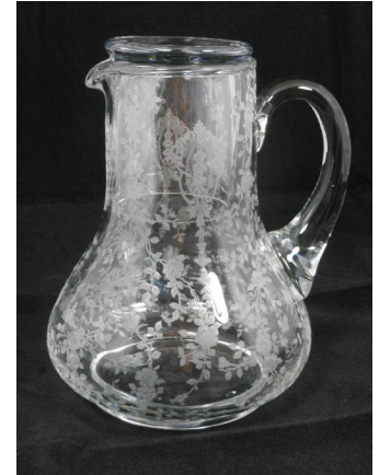
No. 103 Guest Room Jug and Tumbler