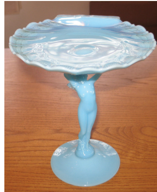
Shell (SS11) comport in Windsor Blue