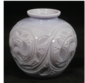
Violet Everglade #23 - 5" Vase