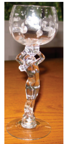
Crystal Roemer, etched Vichy