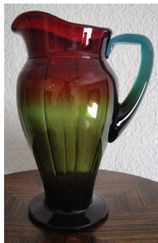
Rubina No. 550 - 48 oz. Pitcher