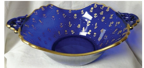
Royal Blue 2 handled bowl GE Chintz