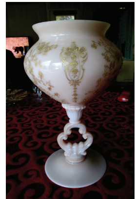
GE Rose Point Crown Tuscan 1305 10 1/2" globe vase with keyhole stem