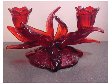
Everglade #3 two-lite candelabrum

I'm trying to focus on nice items that might make your gift shopping a little easier on the wallet. First up this month is a rarely seen Pristine 485 – 9 1/2" crescent salad plate. This one left the table for $115.50. An elegant crystal 278 – 11" vase with a Wallace Sterling base sold for $147. Perfect for the holidays, a gorgeous P427 – 10" salad bowl with pierced Rose Point Wallace Sterling foot ended at $230. A GE Crown Tuscan 1305 10 1/2" globe vase with keyhole stem ended at $185.50.