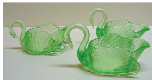
4 1/2" (Style 1) Lt Emerald swans