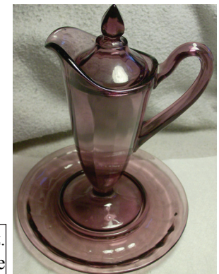
Amethyst 1917/384 – 5 oz. covered syrup and underplate