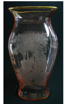
3400/17 – 12" vase with the rarely seen Windsor (Castle) etch