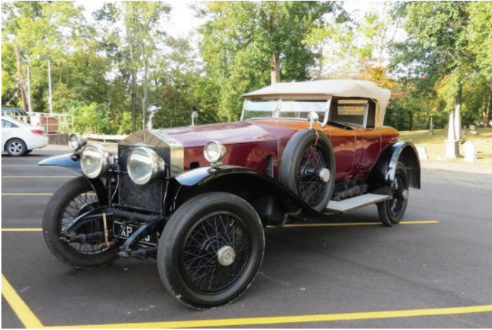
This 1923 Rolls Royce was parked in the lot behind the museum during the tour.