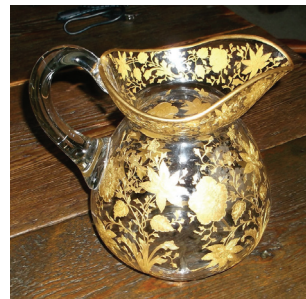
GE Wildflower 3400/141 – 76 oz. Jug

A 3011 – 7" flared comport with Carmen top and crystal stem and foot was packed onto Santa's sleigh for $121.50.