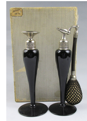
Boxed set (original box in good condition) of Ebony Devilbiss Atomizer and Perfume

A pair of 3121 – 1 oz. Portia cordials ended at $22.72. A lovely GE Elaine 1402/100 goblet sold for $31.01. A very nice Roselyn P306 covered candy sweetened someone's day for $47.87. Ready for the holiday parties, an Elaine 3400/175 – cocktail shaker with chrome top was shaken, not stirred for $50. A stunning heavily GE Wildflower 3400/141 – 76 oz. Jug made its way down the chimney for $161.90. This next beauty was on everyone's list. A rare Pink w/Gold trim 3400/17 – 12" vase with the rarely seen Windsor (Castle) etching was won after a terrific battle for $536.99.