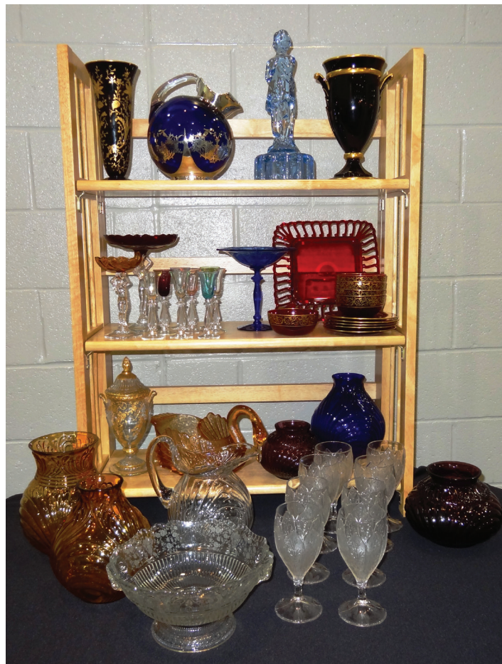
Glass included in the 2013 Museum Forever Raffle.