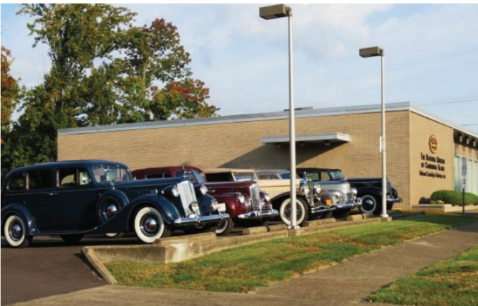
The front row in the museum parking lot filled with spectacular classic cars.