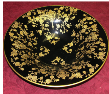
Ebony pristine 430 - 12" belled bowl GE Rose Point