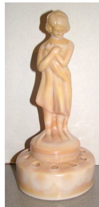
Crown Tuscan No. 518 - 8½" Draped Lady