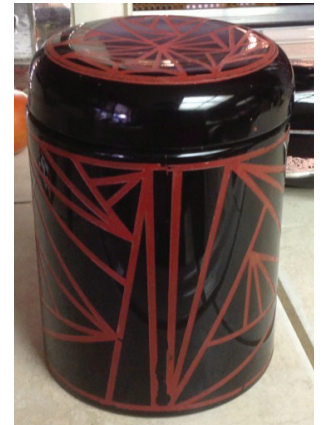
Ebony No. 882 - tobacco humidor with moistener, E729