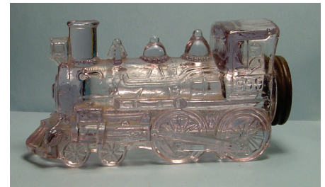
2844 - 1½ oz. Small Engine Candy Bottle (999 Locomotive)