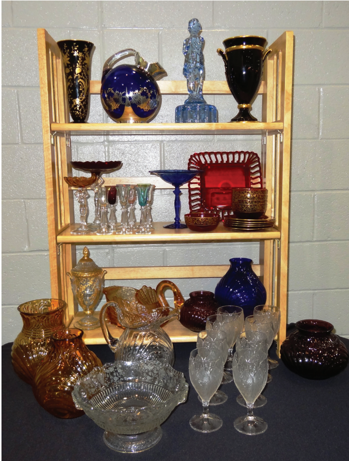
Glass included in the 2013 Museum Forever Raffle.