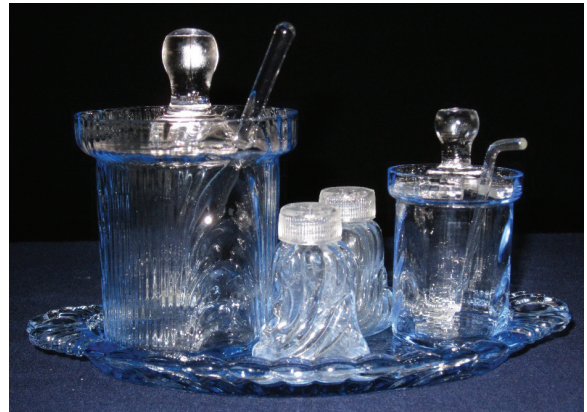
Moonlight Caprice 85 - 5-piece Condiment Set consisting of a 37-tray; 2 - 92-shakers; 87-mustard and 89-marmalade