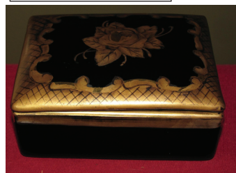
Charleton Gold Rose decorated Ebony cigarette box