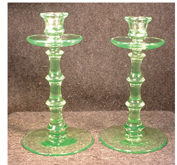
No. 631 - 9" "bamboo" stem candlesticks