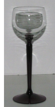
3104 hock with crystal bowl and Amethyst stem and foot