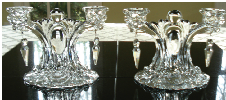
Crystal Caprice 69 - 7½" 2-lite Candelabrum, #5 Prisms (Version 3)