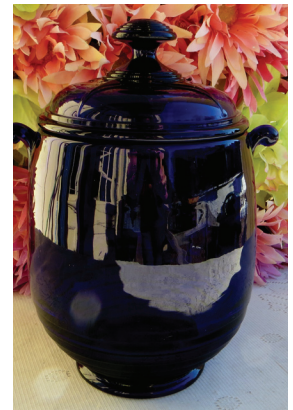
Royal Blue #1402/87 covered Cookie or Pretzel Jar