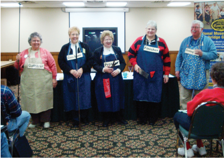
At the conclusion of our program about Cambridge Glass during the State Lions Club Convention at Salt Fork Lodge, members of the audience were invited to dress as glassworkers and demonstrate the process of making fine handmade glassware. They were a very interested group!