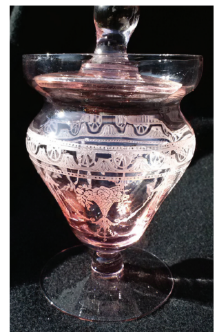
57 - 7 oz. Footed Marmalade and Cover E 701