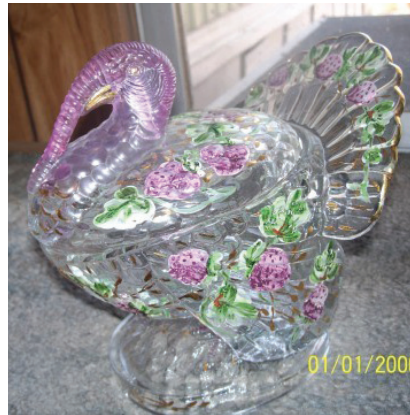
1222 Turkey with hand painted decor