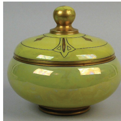
Flashed Primrose No. 102 - 6" Bonbon and Cover