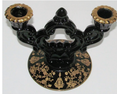
3400/647 - 6" 2-lite candlestick Ebony and Gold Encrusted Rose Point