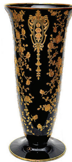
278 - 11" Ebony GE Rose Point vase.