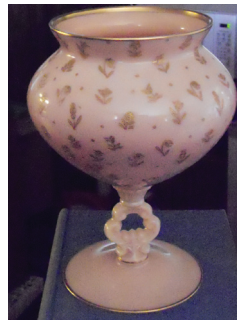
Crown Tuscan 1302 - 9" GE Chintz No. 2