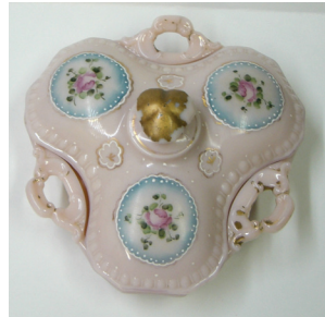
Crown Tuscan 3500/57 - 8" 3-compartment Candy Box and Cover with exquisite Charleton Blue Mist decoration.

There were some nice swans this month, here is a sample. A 1042, style 1 - 6 1/2" Lt. Emerald swan went for $75. The next swan advertised as "Goofus glass" is a conundrum. A 1042, style 1 - 6 1/2" crystal swan that was painted gold on the exterior sold for $78.77. I don't feel Cambridge did this treatment, but perhaps another company?? If someone out there knows, drop me a line. Next we have two 1221 - 16" crystal swan punch bowls. The first had a base but no cups and was sold for $764.43. The second had 12 cups and a ladle, but no base. It managed $950. Both swans had slight condition issues, but what swan punch bowl doesn't? Next we have a lovely Crown Tuscan 3500/57 - 8" 3-compartment Candy Box and Cover with exquisite Charleton Blue Mist decoration. The lucky bidder only spent $49.99. And the last item was a lot of four