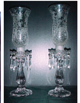
Wildflower 1613/1615 - 18" Hurricane Lamps.