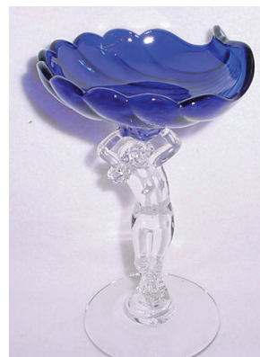
3011/29 - 4" Mint Dish