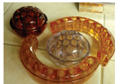
Four flower frogs including a pair of Amber 2900 - 7" Flower Circles.