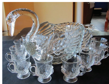
1221 - 16" crystal swan punch bowl with 12 cups and a ladle.