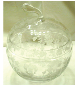
Blown 316 - 5" apple candy box and cover with crystal stem etched in Rose Point.