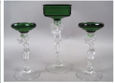
Forest Green 3011 - 10" covered cigarette box and 2 matching 3011 ashtrays.