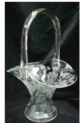
#119 Rose Point basket