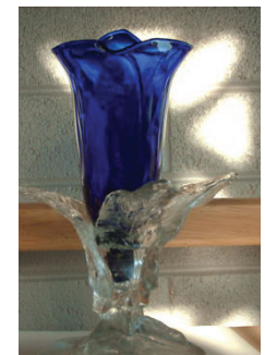
Crystal Everglade candlestick with Royal Blue flower holder