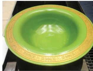
Avocado bowl GE #527