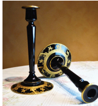
Ebony candlesticks GE Imperial Hunt Scene