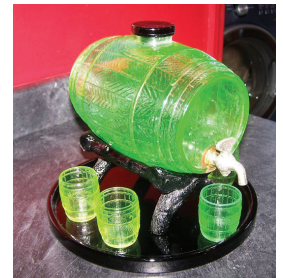
No.1 Keg Set with tray