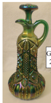
Green carnival treated 2666 32 oz. decanter