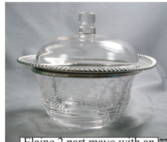
Elaine 2 part mayo with an interesting lid