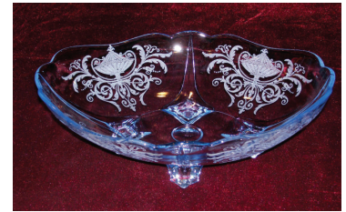
12" Oval Bowl with E739