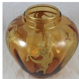
GE Dancing Ladies Temple Jar