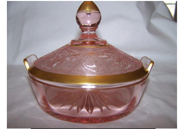
Pink covered butter E520